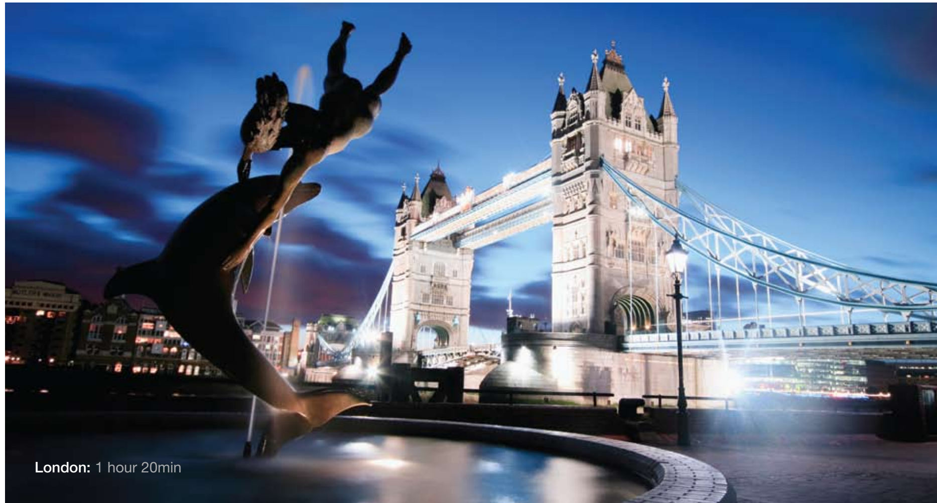
London: 1 hour 20min