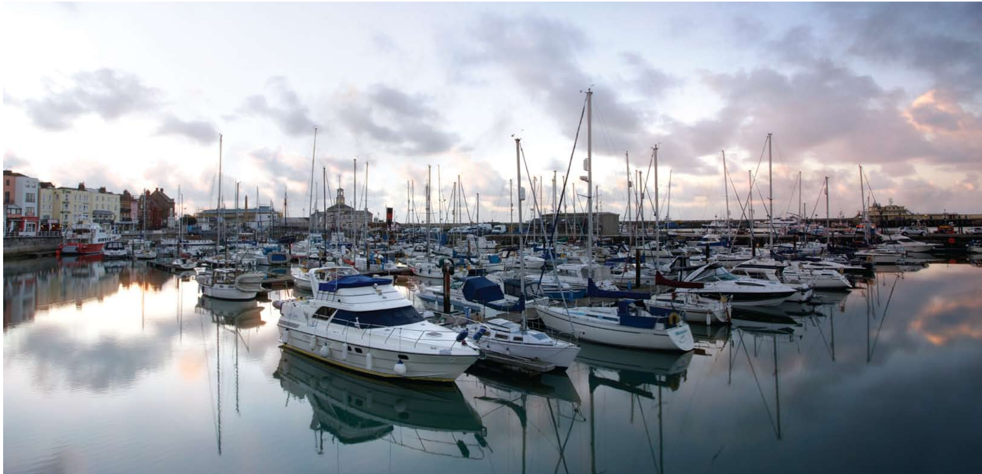
Mornings watching the sun rise over the harbour