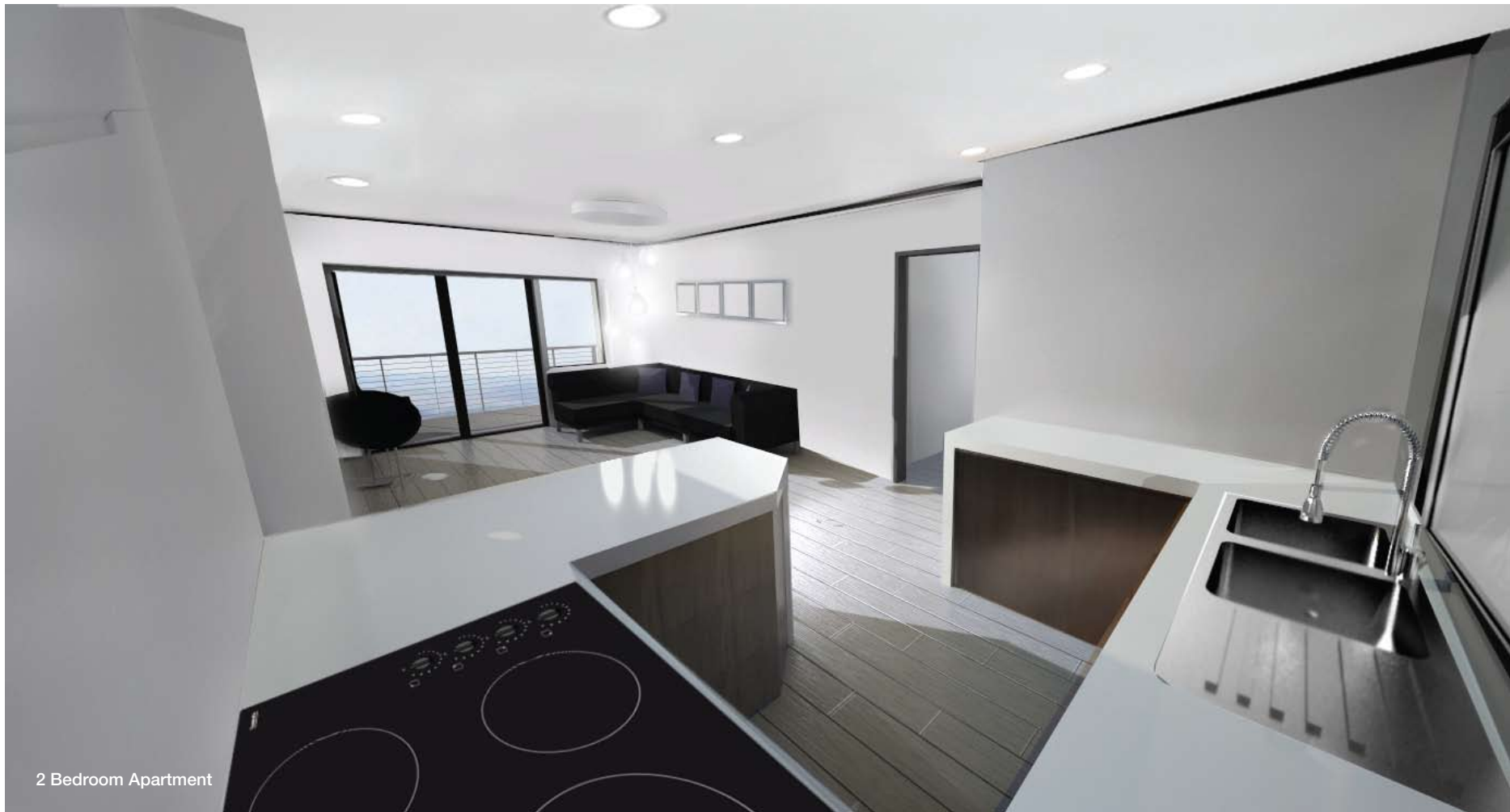
2 Bedroom Apartment