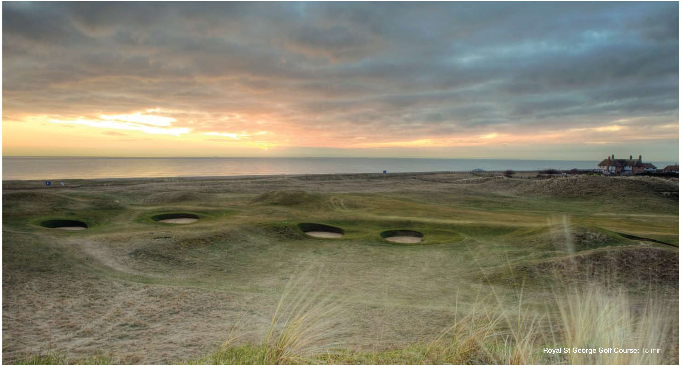
Royal St George Golf Course: 15 min