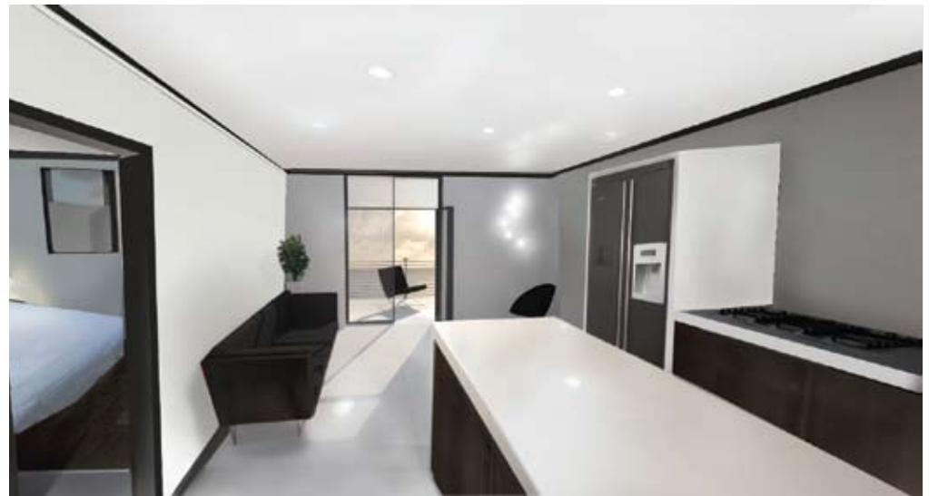
1 Bedroom Apartment