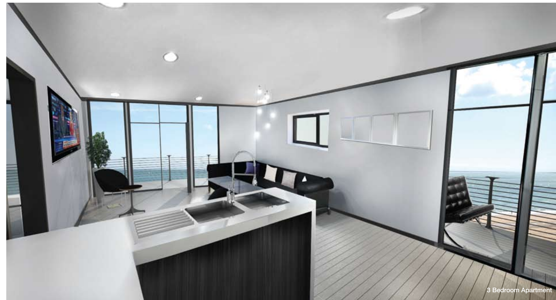
3 Bedroom Apartment

Take advantage of alfresco dining opportunities at the stylish ground floor cafes and restaurants.